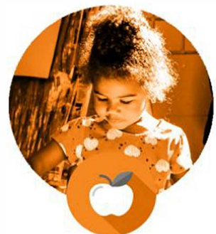
Head Start & after school programs