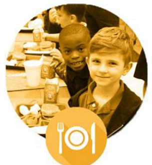
school lunch assistance